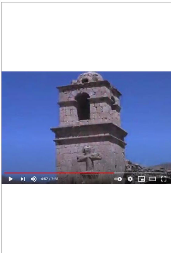
Image: View of cemetery tower