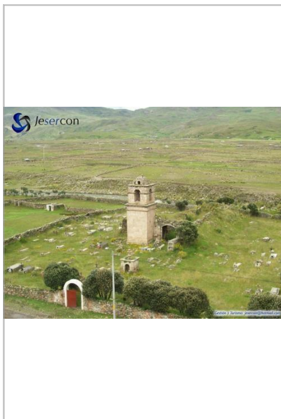
Image: General view of cemetery